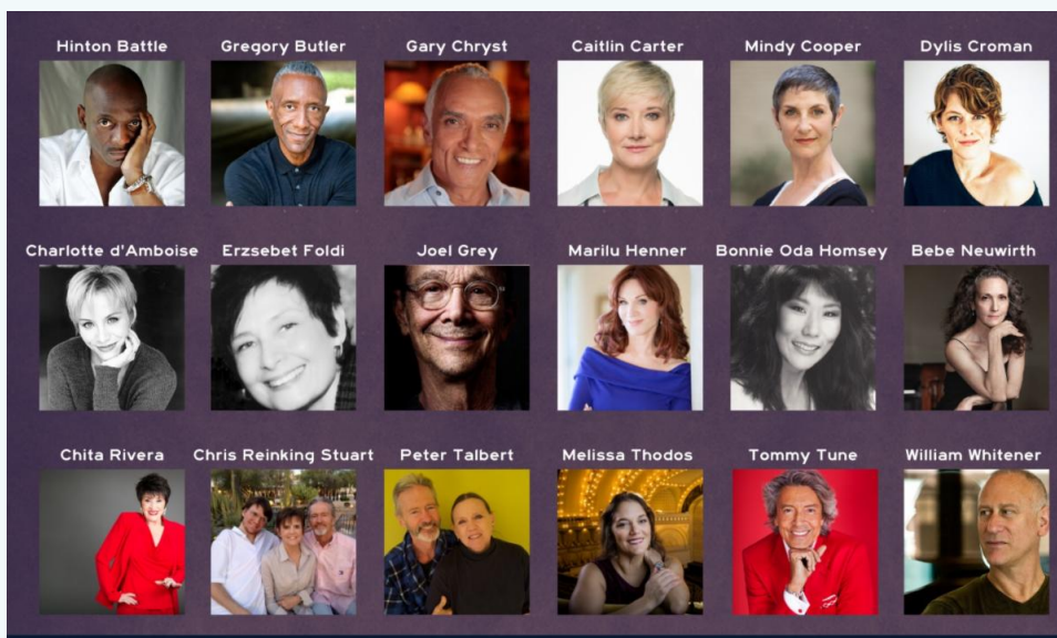
ANN REINKING SCHOLARSHIP PROGRAM • ADVISORY BOARD